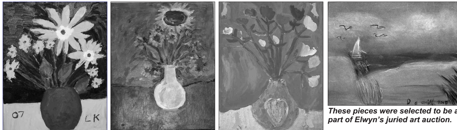
These pieces were selected to be a part of Elwyn's juried art auction.

Greeting cards featuring Arc artists' designs are available for sale at the Ocean City Fine Arts League, 943 Asbury Avenue in Ocean City. Proceeds benefit the artists and the outreach art program.