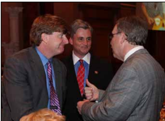
Congressman Patrick Kennedy (D-RI) and Congressman Rob Andrews of New Jersey (D-NJ) speak with a guest following Kennedy's speech at The Arc's 2010 Tribute.